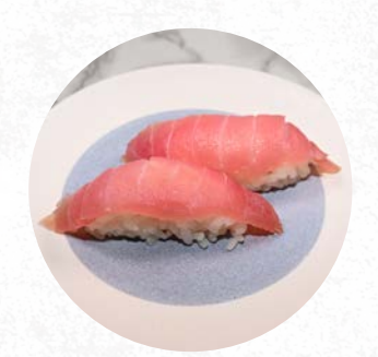
Salmon Nigiri (GF)