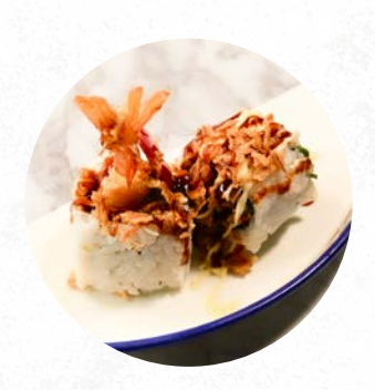
Salmon Tobiko Roll (GF)